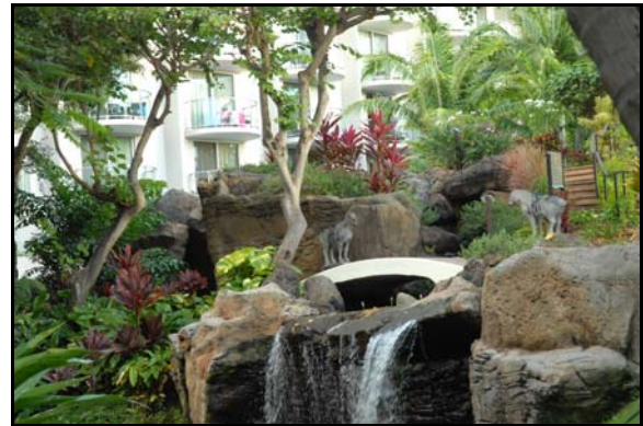
Another Waterfall in Maui