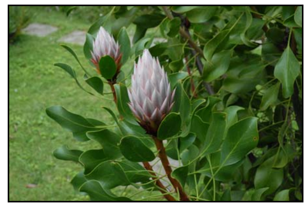
At the Kula Garden on Maui

Based on the extent of genetic divergence found among present-day bromeliads, calibrated against the amount of such divergence among various groups of monocots, Givnish and his colleagues inferred that bromeliads arose roughly 70 million years ago, as terrestrial plants with C3 photosynthesis, on moist infertile sites in the Guayana Shield. Subsequently, they spread centifugally in the New World, and reached tropical West Africa (in the form