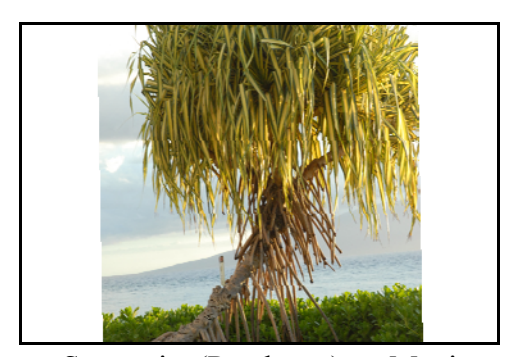
Screwpine(Pandanus) on Maui

At recent meetings, I have noticed that our members have only a vague idea of how the Bromeliad Family with its more than 3,200 species is organized. Understandably, they are concentrating on the challenge to grow plants that come from (sub)tropical or dessert, low or high altitude, hot or cold, dry or wet environments in their indoor apartments or homes. Moreover, many once popular species are not well known today and are hard to find because of the explosion of attractive hybrid cultivars that has swamped the bromeliad world. We do need discussion and information about horticultural techniques (about which very little is written), but a basic understanding of the family is also essential for a grower's Family Bromeliaceae (Bro-meel-ee-ay-see-ee) is a part of the education. flowering plants (angiosperms) subdivision of the the Plant Kingdom. All of its species are monocotyledons (monocots), that is to say that each seed initially has only one leaf. Dicots have two seed leaves. Until about 4 years ago the family was divided into three sub-families: Pitcairnioideae, Tillandsioideae Bromelioideae Now taxonomist have converted former Pitcairnioideae into 6 new sub-families: Brocchinioideae, Lindmanioideae, Hechtioideae, Navioideae, Pitcairniodeae and Puyoideae.