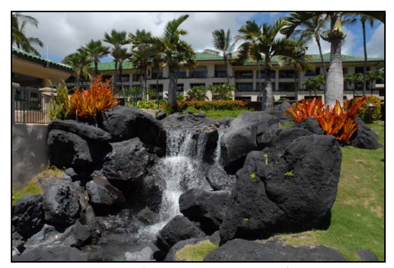
Grand Hyatt Resort on Kauai